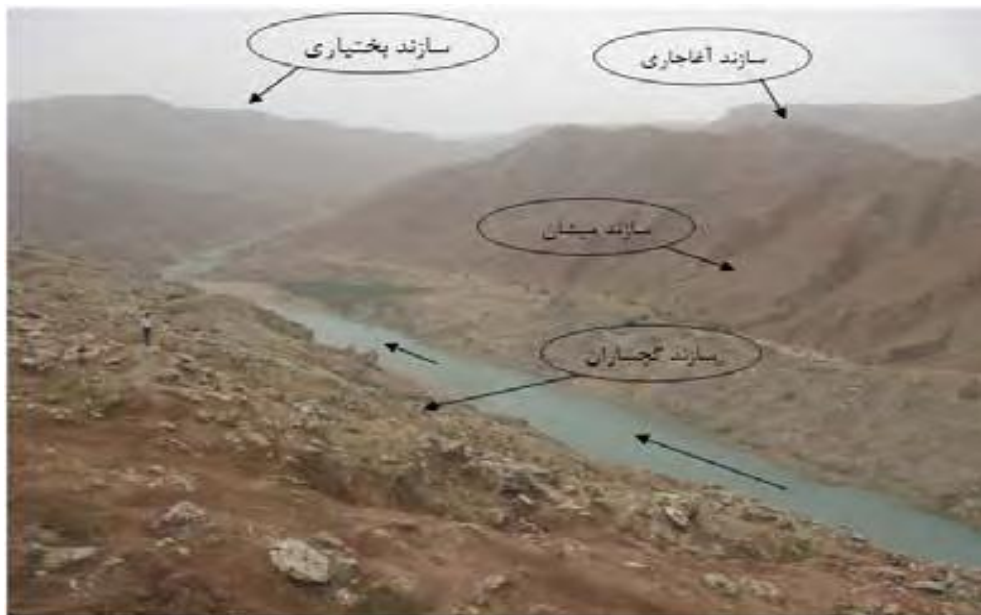
Fig 1: Location of dam’s reservoir foundations.

The dam reservoir, being longer than 90 km, is surrounded by Aghajari, Mishan, Lahbari, Bakhtiyari (conglomerate, Figure 1)