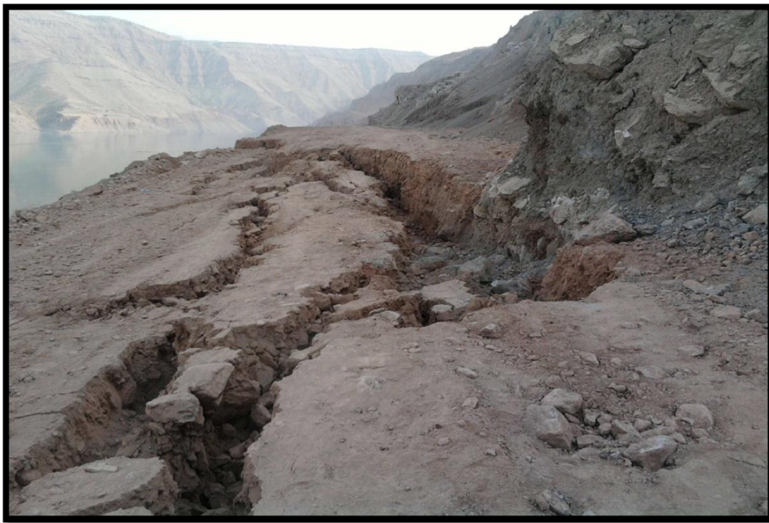
Fig 3: cracking in the embankment after dam impounding

Concerning the results obtained, reviewing the prepared photos and according to the opinion of experts engaged in the project, the quality of soil was evaluated as somehow mid to low.